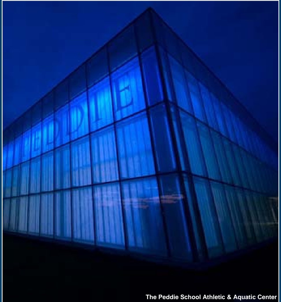
The Peddie School Athletic & Aquatic Center