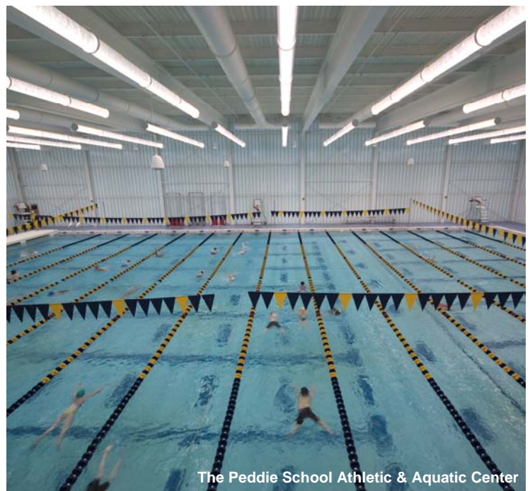
The Peddie School Athletic & Aquatic Center

Illumination Arts firmly believes that attention to operational issues is the key to achieving a lighting design that truly meets the needs of an academic campus and results in a lighting design that is beautiful and effective over the long term. When lamps, luminaires and lighting controls are specified with this in mind, the owner can be assured of a building, space or campus that maintains its relevance.