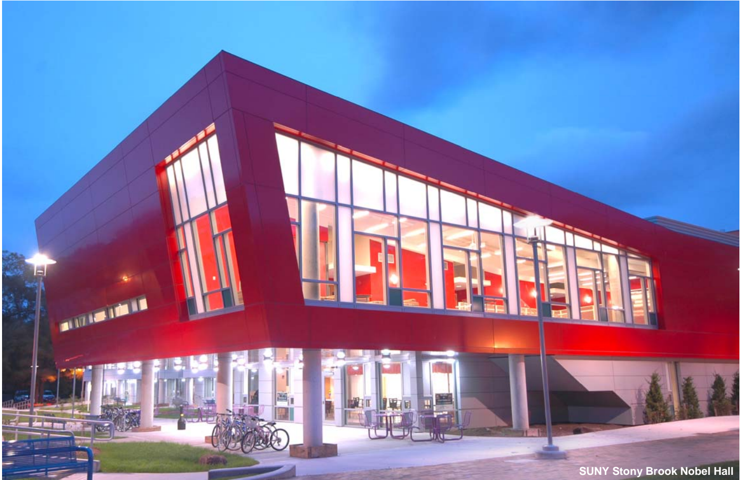
SUNY Stony Brook Nobel Hall