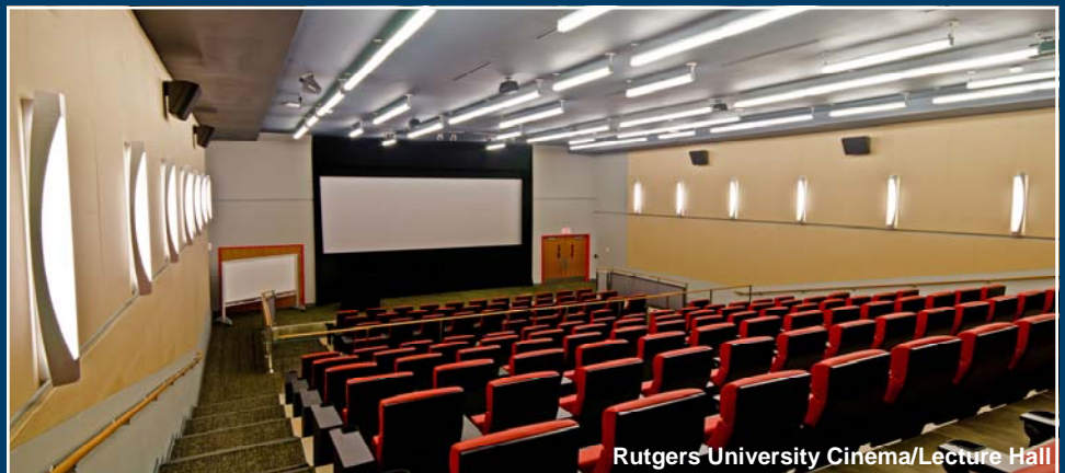
Rutgers University Cinema/Lecture Hall