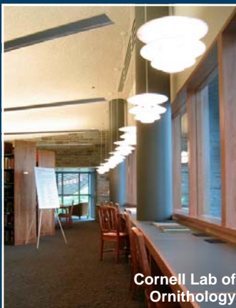
Cornell Lab of Ornithology