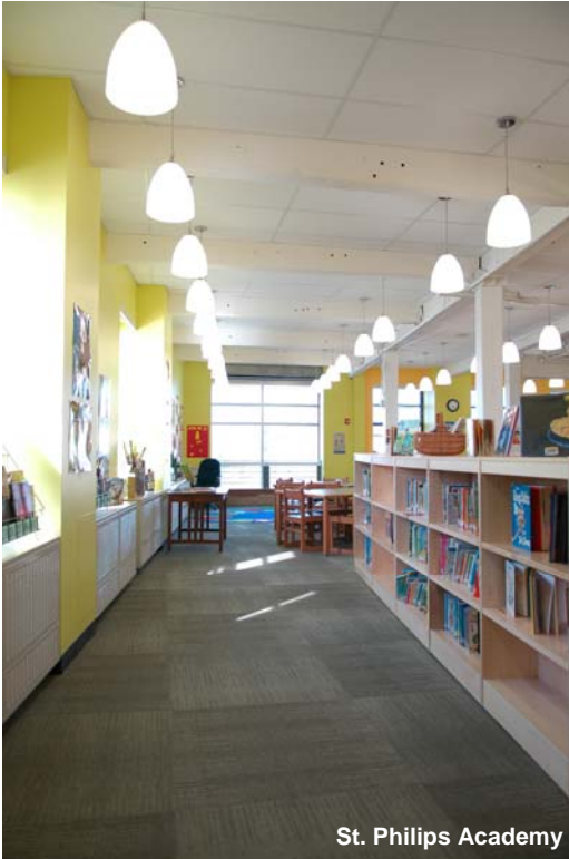
St. Philips Academy