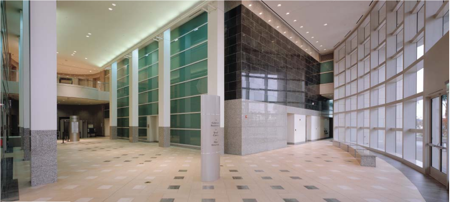
West L.A. Courthouse