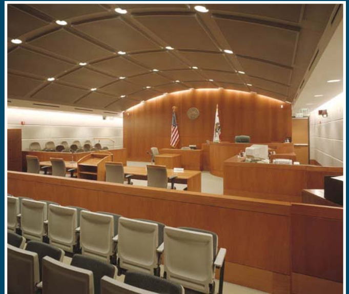
West L.A. Courthouse