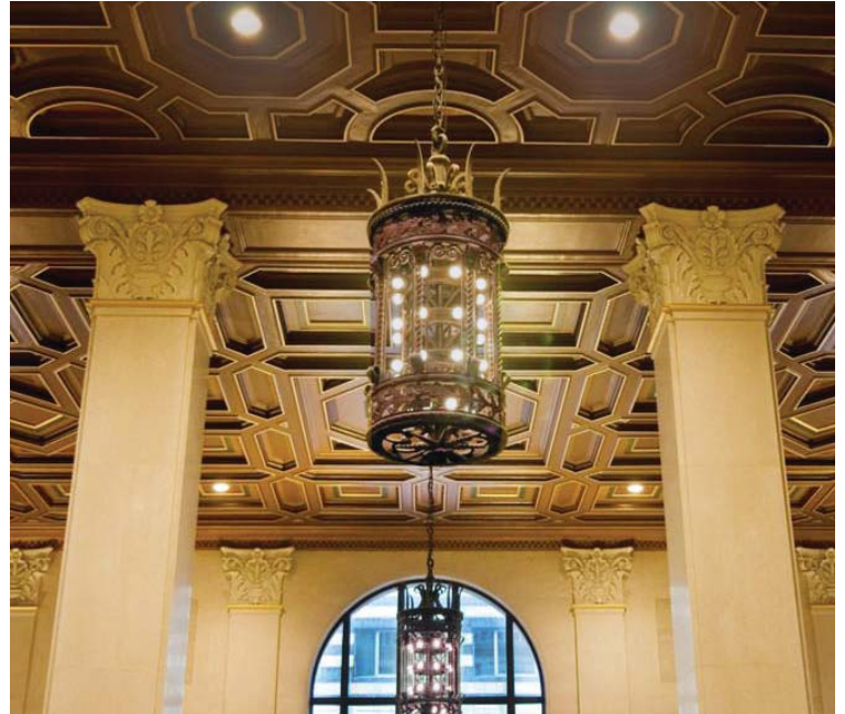
Kings County Courthouse

A beautiful architectural experience and effective visual solutions are only two goals for a successful lighting design. For the design to meet all of the owner's needs, the team must also take into account capital and operating costs, ease of maintenance and energy efficiency. At a criminal justice facility, this includes the practical considerations of vandalism and suicide, and requires the selection of appropriate luminaires. Illumination Arts firmly believes that attention to these operational issues is the key to achieving a lighting design that is effective over the long term and assures that the facility maintains its relevance.