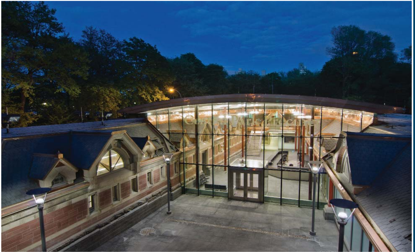
Central Park Police Station