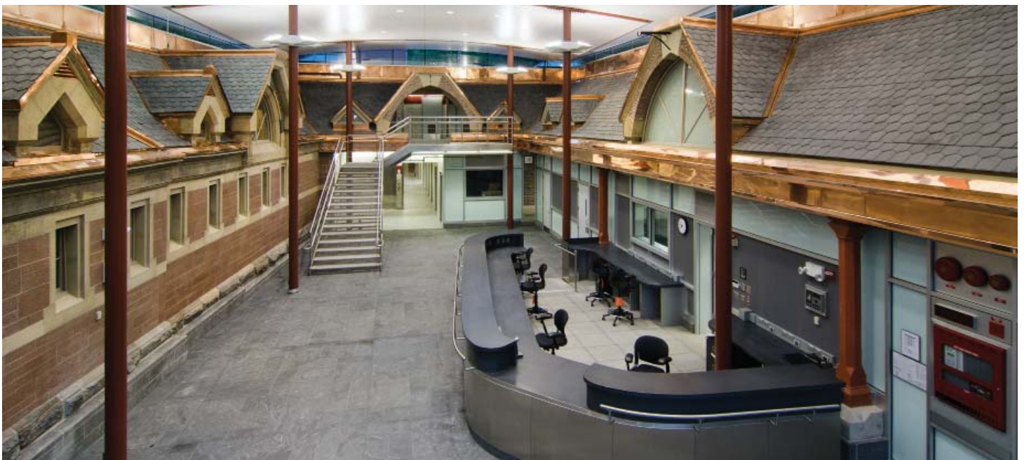
Central Park Police Station

At Illumination Arts, energy and environmental considerations are an integral part of the design process. Whether your project is pursuing Net Zero Energy consumption, LEED certification or just responsible citizenship in the built environment, Illumination Arts can ensure that our lighting design not only addresses the architectural and visual requirements of your project, but also your energy and operating costs over the long term. In addition, as they have done on numerous projects, Illumination Arts can recommend ways in which to most effectively use electric lighting and daylighting to minimize your carbon footprint while providing an effective and appropriate visual experience for everyone in your facility.