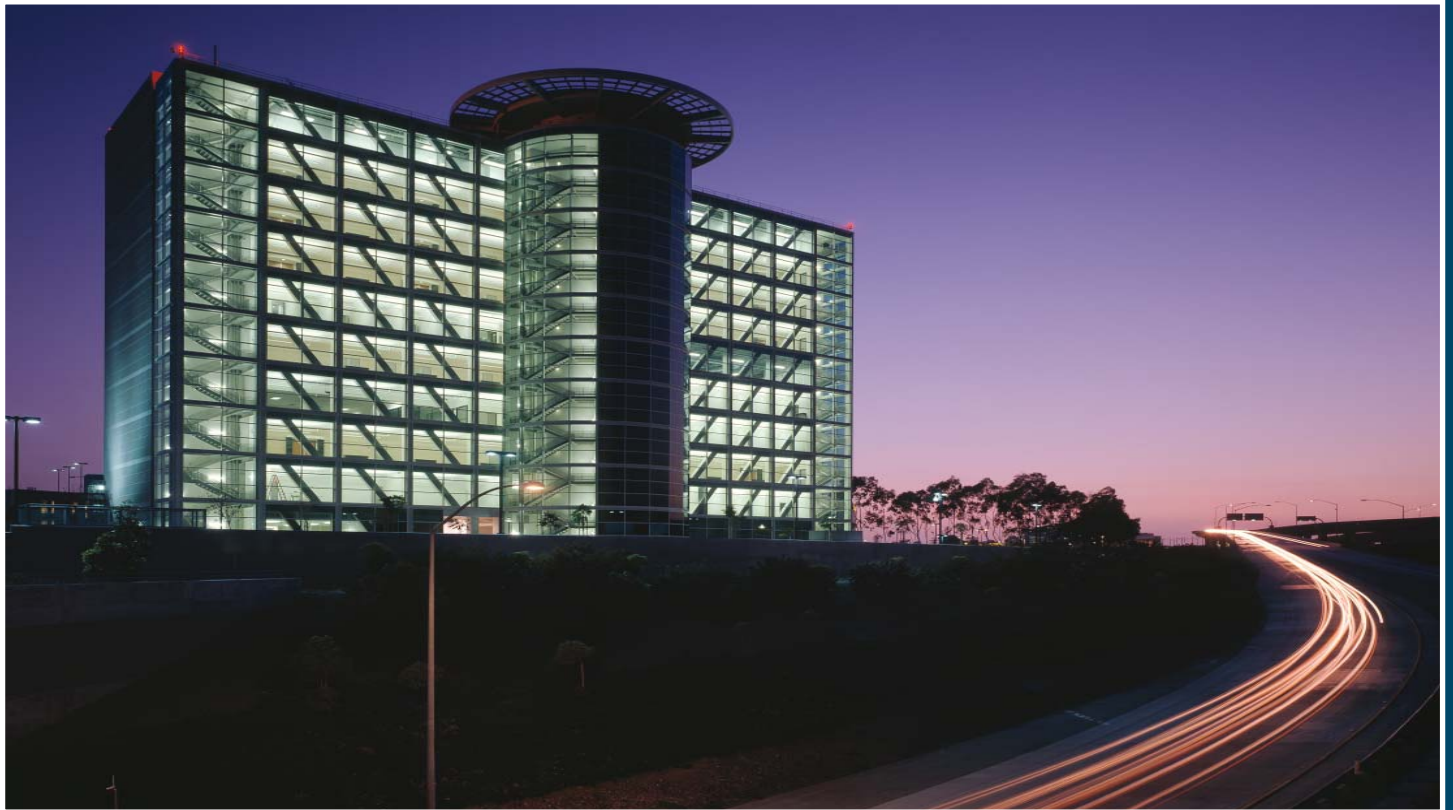
West L.A. Courthouse

Illumination Arts has a depth of experience that can ensure the long-term beauty, effectiveness, and viability of your lighting system.